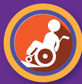
Ramp for Wheelchair