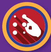
EVM with Braille